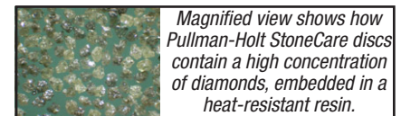
Magnified view shows how Pullman-Holt StoneCare discs contain a high concentration of diamonds, embedded in a heat-resistant resin.

With the Pullman-Holt StoneCare system, you can achieve professional results simply and easily without hours of training. Recently, a major national chain of department stores discovered that with one hour of practice, their own maintenance personnel produced a great finish using the following steps from the Pullman-Holt StoneCare system: