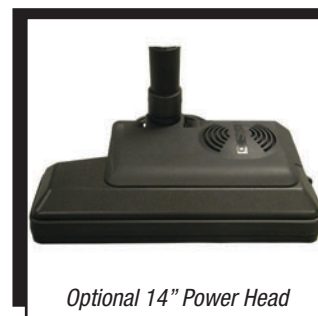
Optional 14" Power Head